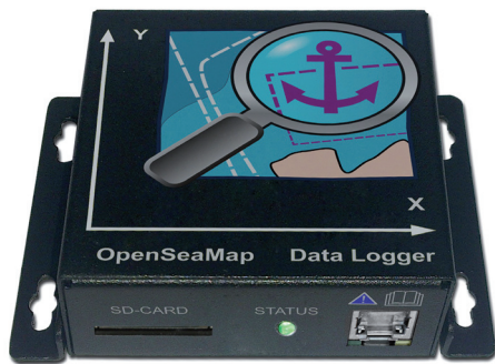
Hardware-logger from OpenSeaMap

http://depth.openseamap.org/order-logger